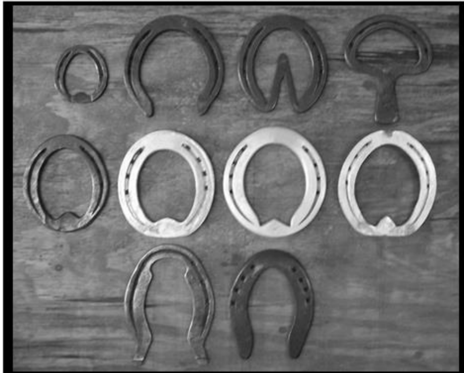
All corrective shoes are handmade by students At the Oklahoma Horseshoeing School

OKLAHOMA HORSESHOEING SCHOOL, INC 26446 Horseshoe Circle Purcell, Oklahoma 73080 405-288-6085 800-538-1383 405-288-1004 Fax www.horseshoes.net