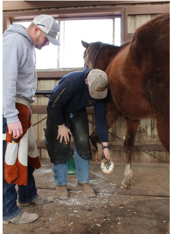
1st Week Student having his hoof checked to see if it is level.