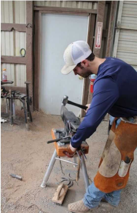
Students First Day in the Shop